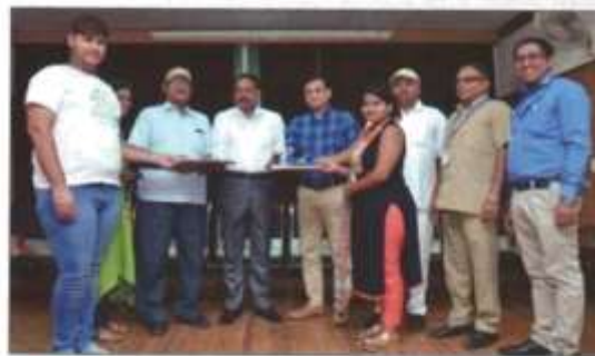
Honouring the winner of the programme