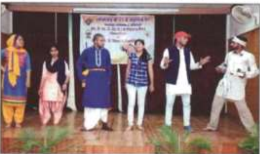
Performing the Act on voter awareness