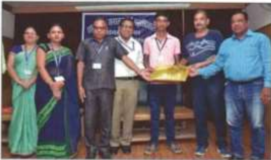
Honouring the winner of speech