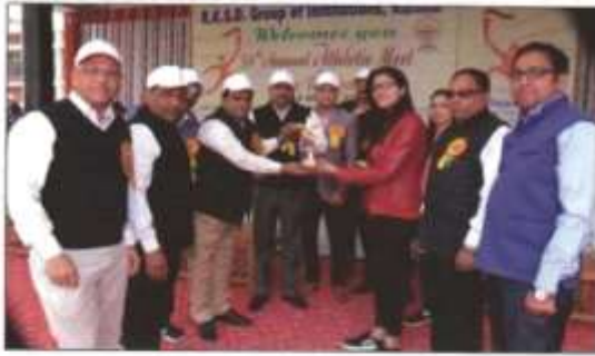
Honouring the KUK topper