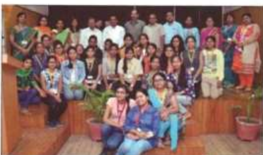
Management with all the winners & participants