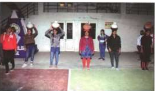
Glimpse of Chaati Race