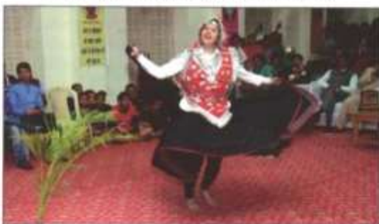
Glimpse of Athletic Meet