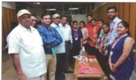
Judgement in Rakhi Making Competition