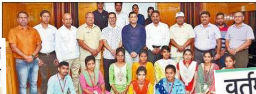
विद्यार्थियों को सम्मानित करते कॉलेज प्रबंधन समिति व स्टाफ सदस्य