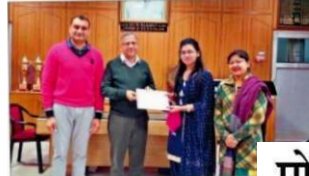
आर.के.एस.डी. महाविद्यालय जिला युवा संसद में रहा प्रथम

कैथल 23-24 फरवरी को दिल्ली में राष्ट्रीय युवा संसद में लेबी चला