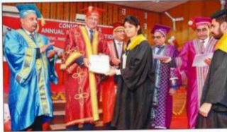
विद्यार्थियों को डिग्री प्रदान