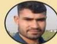
Harvlas UGC-NET Political Science