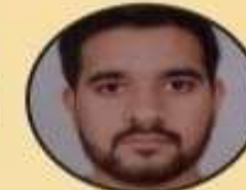
Yash UGC NET Economics