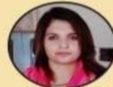
Neelam UGC-NET Political Science