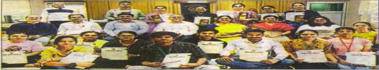
आरकेएसडी कॉलेज में चयनित विद्यार्थियों के प्राचार्य व स्टाफ।